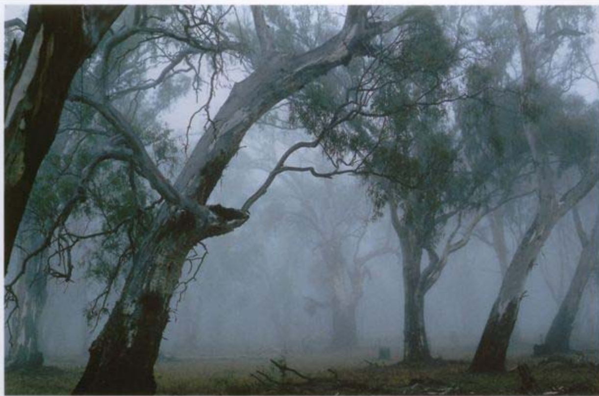
Old-growth River Red Gums, Barmah Forest

The Reichstein Foundation 2 nd Floor, 172 Flinders Street Melbourne 3000 Victoria Australia Telephone: 61 (03) 9650 4400 Fax: 61 (03) 9650 7501